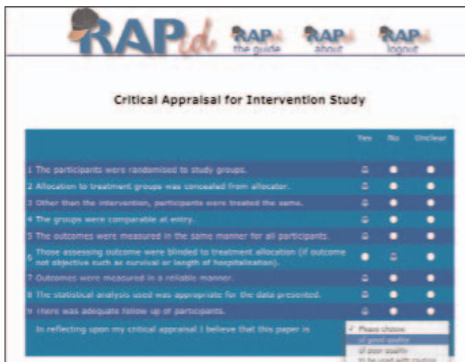
JBI's RAPid training tool enables users to evaluate research articles and write structured research findings to publish on the JBI interface.